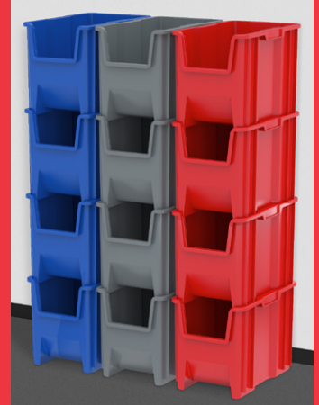
Stack bins together to form vertical storage and picking systems.