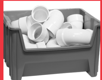
Perfect for organizing odd shaped items such as bundles of wire, hoses, PVC pipe or large tools.