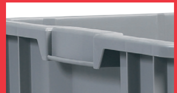
Large, comfortable handles.