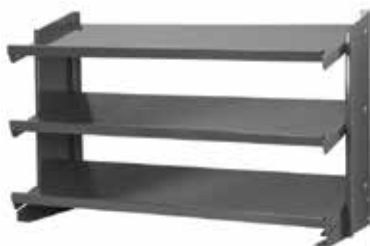
Bench Pick Rack