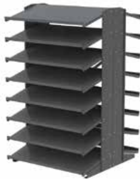
Double-Sided Pick Rack