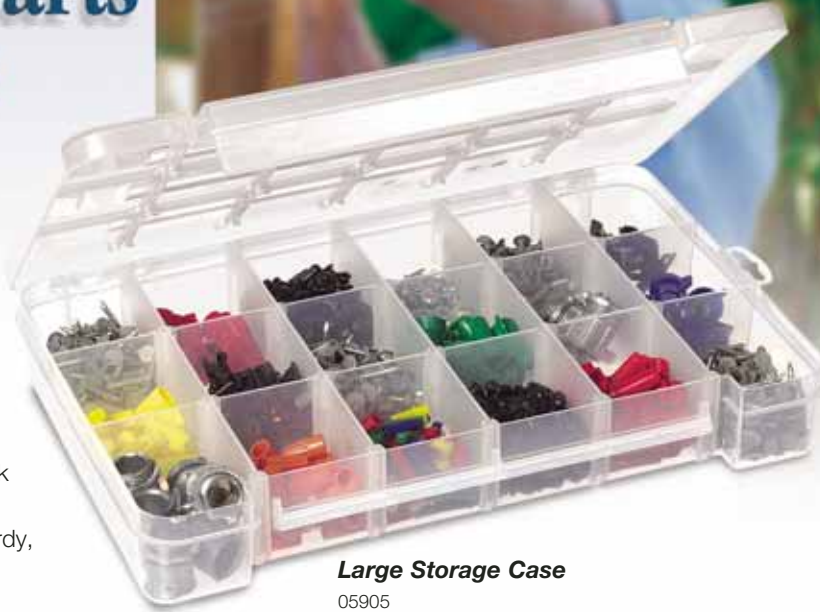
Large Storage Case 05905