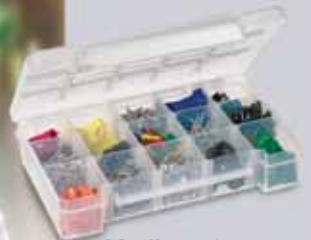
Medium, 2 fixed dividers 05805