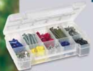
Medium, 1 fixed divider 05807