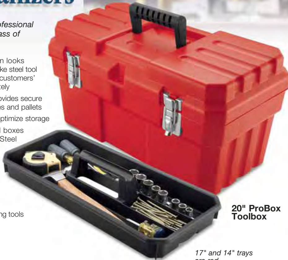
20" ProBox Toolbox