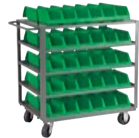
Multi-Shelf Cart Model No. R5SYT5HR2436

* Not available in 18" x 30" or 18" x 36" Decks