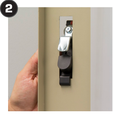
Once the top is disengaged, slide up to completely remove assembly.