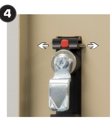
Firmly press top in place so wedge clips snap open to secure the lock.