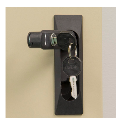
Akro-Mils Secure Mini-Cabinets are provided with a locking swing handle. Follow these steps to replace this handle.