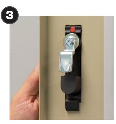
To install new lock, slide bottom in first to align in the opening.